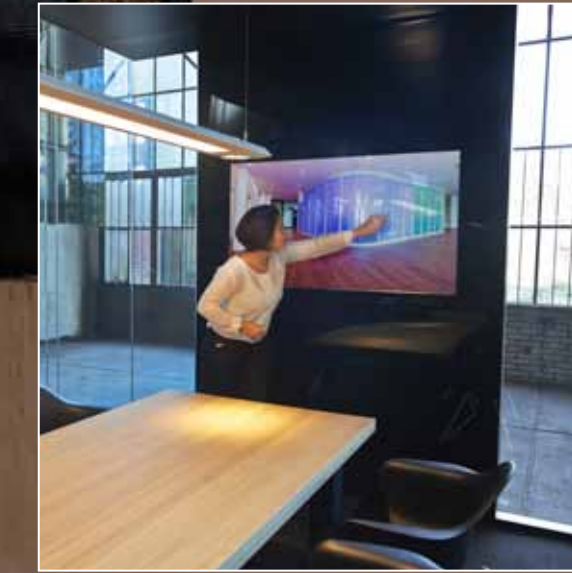
Partial solid wall with integrated multimedia panel.