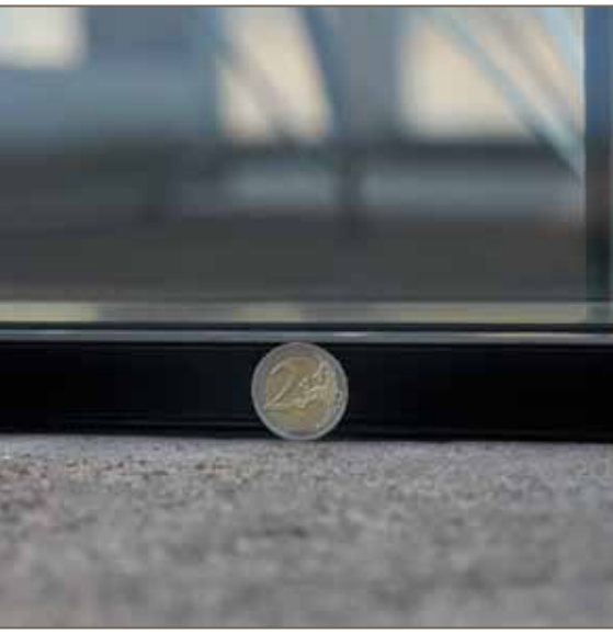
Lowest sections in the world.