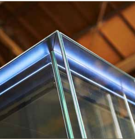
Integrated LED mood lighting.