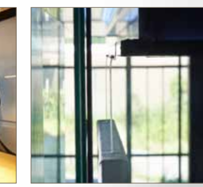
Integral suspension rail.