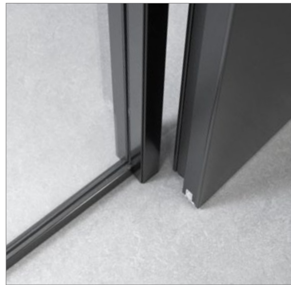
Perfect fit with other steel walls and doors