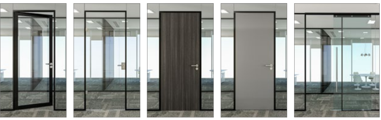
Framed glass door