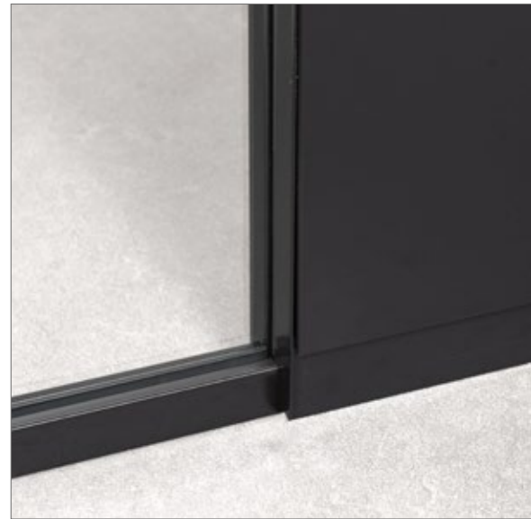
Seamless connection with other Maars Living Walls