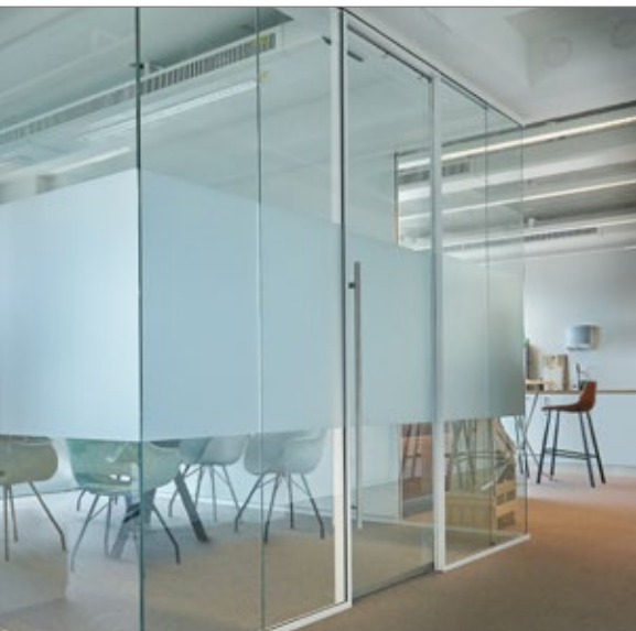
Acoustical sliding door